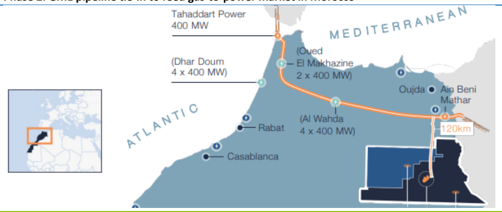
Phase 2: GME pipeline tie-in to feed gas-to-power market in Morocco

Phase 2 will use the capacity in the GME export pipeline infrastructure in northern Morocco to provide the joint venture (JV) partners with a preferred route to monetisation. A new build 120km tie-in to connect to the GME pipeline is planned as part of a wider Phase 2 gas development to produce for the gas-to-power market, which is a key element of Morocco's energy strategy. While we think that the domestic gas market can easily absorb the entire discovered resource volumes at Tendrara, we recognise that connecting to the GME export pipeline also opens access to the European market with confirmed capacity by Spain and Portugal, two import-dependent geographies, to absorb additional volumes.