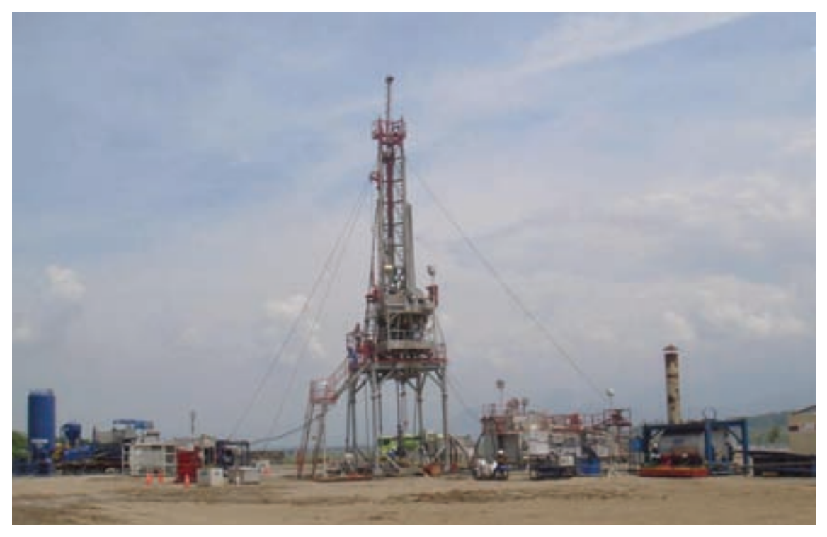
Figure 1: Lekom Maras HWO rig and surface equipment setting up for DST 3 on Pasundan-1 in November 2008.

In May 2008 the Citarum PSC was placed under new operatorship following the purchase of previous operator BPREC's interest by Pan Orient Energy Holdings. This change has placed the PSC in firm financial standing and allowed progress on a full technical programme to address the exploration potential of the block. A one-year extension to the First Exploration Period (Contract Years 1-3) has been successfully negotiated with BPMigas. The granting of the extension required a 35% relinquishment of the PSC area which was formally approved by BPMigas in March 2009. The relinquishment comprised non-