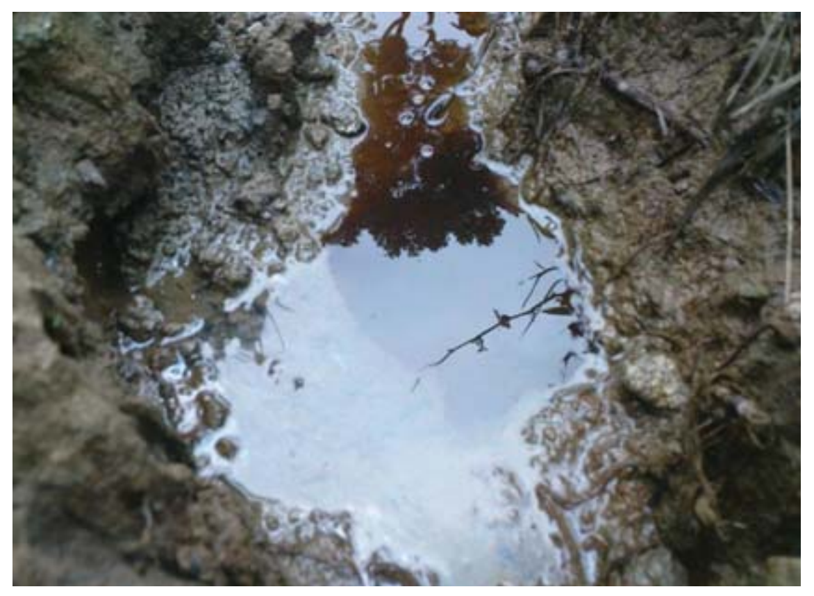
Figure 5: Active oil seep close to old Maja-1 trial boring in the southeast of Citarum PSC

The seismic survey is supported by field geological studies in collaboration with two local universities. Preliminary studies have revealed an active oil seep on the PSC in the Majalengka area close to the site of a trial boring made by Dutch company NHM in the 1870s (Figure 5). This occurrence provides significant encouragement for the prospectivity of this area of the block.